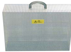
Type C2 Governor hood for Ø300 and Ø400 pulleys, suitable for SCHINDLER type GBF w=540, h=350, d=100-175 art. no. 78294 governor hood type C2