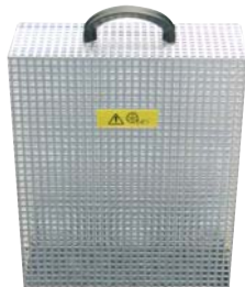
Type C1 Governor hood for Ø300 pulley, suitable for Schindler type NR0, NR1 and others w=350, h=430, d=100-175 art. no. 78293 governor hood type C1