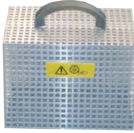
Type A Governor hood for Ø200 pulley, suitable for BODE-controller w=250, h=230, d=100-175 art. no. 78627 governor hood type A