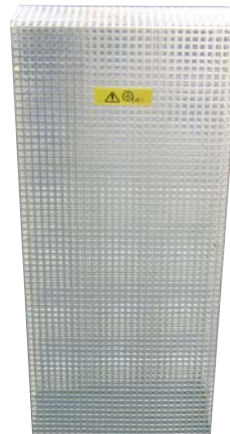
Type E Hood for Ø300 governor or shaft copying pulley. The hood can be fixed to the floor with dowels, angles and butterfly nuts. (Included in delivery.) w=350, h=800, d=100-175 art. no. 78274 covering hood type E