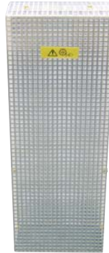
Type D Hood for Ø200 governor or shaft copying pulley. The hood can be fixed to the floor with dowels, angles and butterfly nuts. (Included in delivery.) w=250, h=680, d=100-175 art. no. 78273 covering hood type D