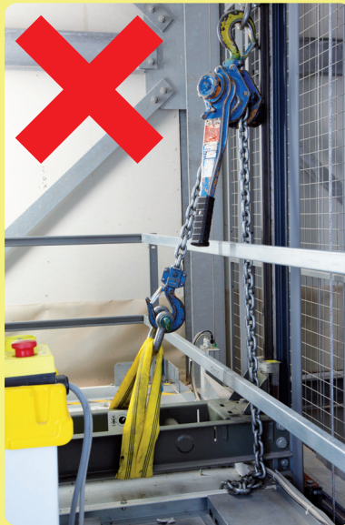
The sling is placed too far away.