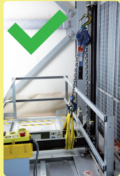
The sling is placed almost perpendicularly below the Brake.

Note: protect the sling if the beam has sharp edges.