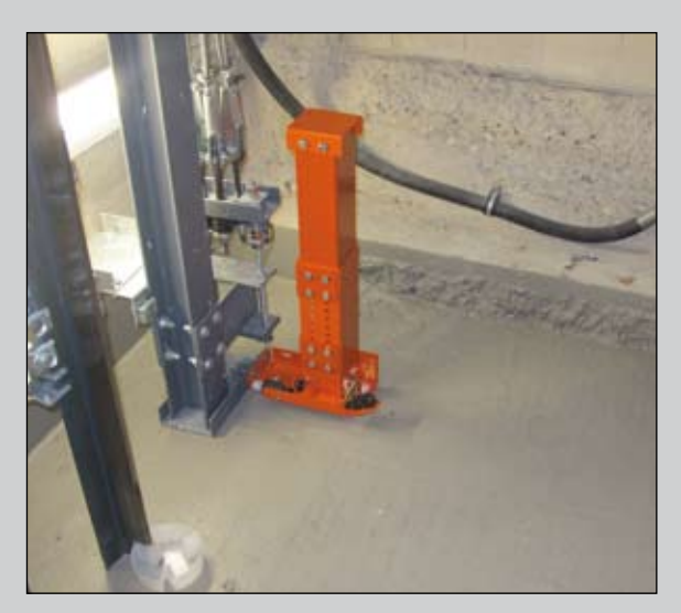
Example: Fixation of the maintenance support at the piston support