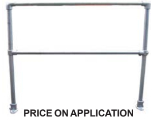
PRICE ON APPLICATION

Customers specifications available upon request.