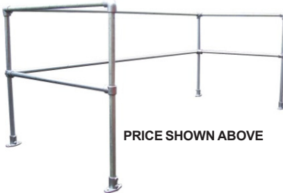
PRICE SHOWN ABOVE