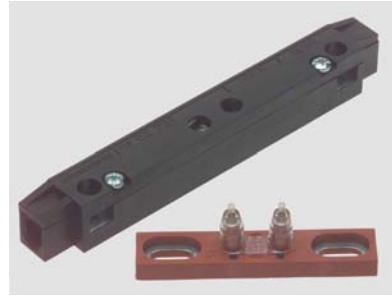
DZ 73 - Safety Contact